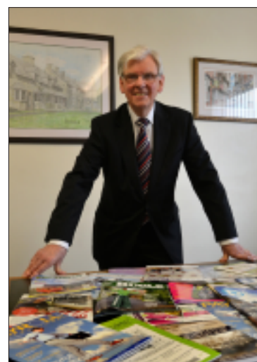
Warwick Printing has seen an increased turnover of 125 per cent in the last four years and staff numbers have doubled.

While profits have been down for other companies in the area with some being forced to close,